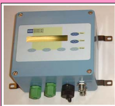
evaluation unit HK5

paper cardboard graphic paper wrapping corrugated cardboard wallpaper